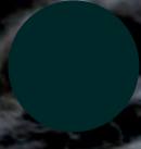
410 dark green ca. Pant. 560c