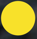
110 yellow ca. Pant. 012c