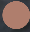
005 cream ca. Pant. 479c