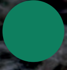
400 green ca. Pant. 7727c