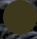
430 olive ca. Pant. 7763c