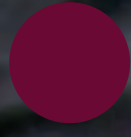
270 burgundy ca. Pant. 188c