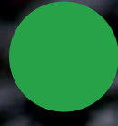
422 light green ca. Pant. 362c