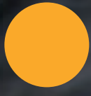
106 sunflower yellow ca. Pant. 137c