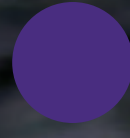
280 purple ca. Pant. 2096c