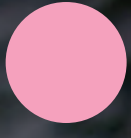
252 pink ca. Pant. 507c