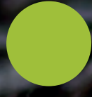
421 apple green ca. Pant. 368c