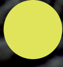
101 neon yellow