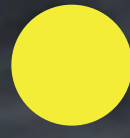
100 lemon ca. Pant. 7405c