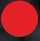
210 signal red ca. Pant. 185c