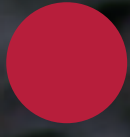
200 red ca. Pant. 186c