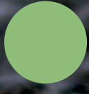
420 pastel green ca. Pant. 358c