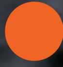
180 orange ca. Pant. 021c