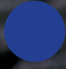
300 royal blue ca. Pant. 286c