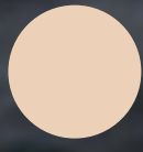
004 beige ca. Pant. 4685c