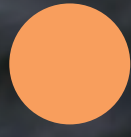
185 light orange ca. Pant. 1495c