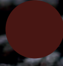
550 brown ca. Pant. 7616c